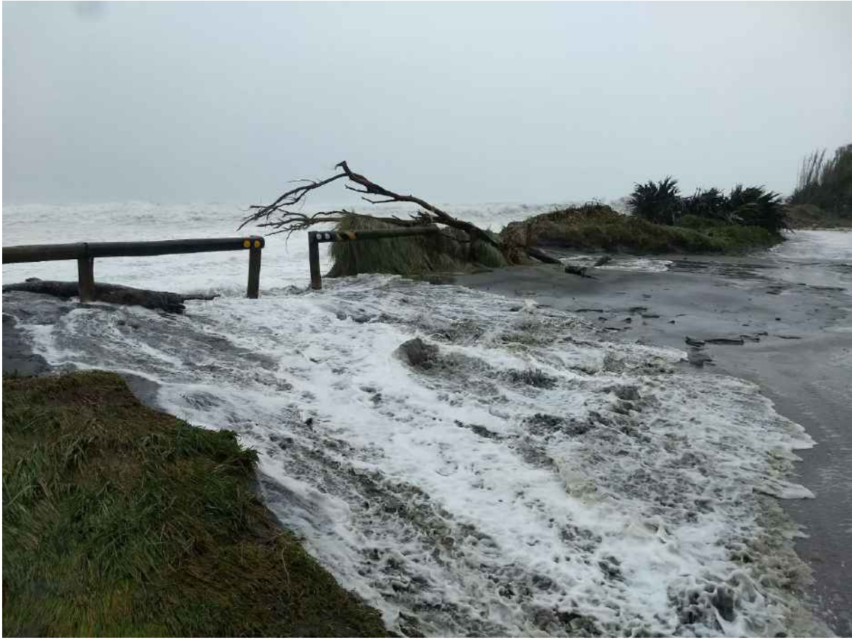
Coastal inundation at the South Spit car park