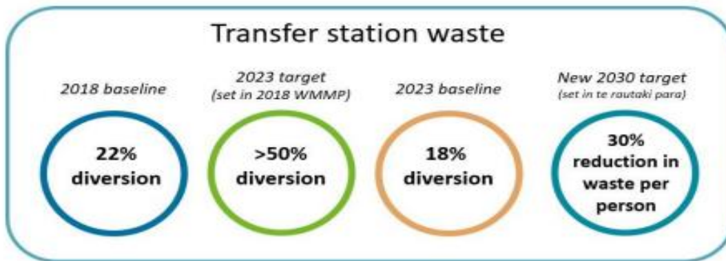
Figure 2.8: Transfer station diversion tracking against targets.