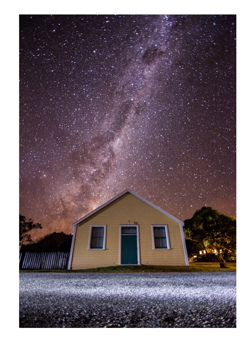
Photo Donovans Store, Okarito